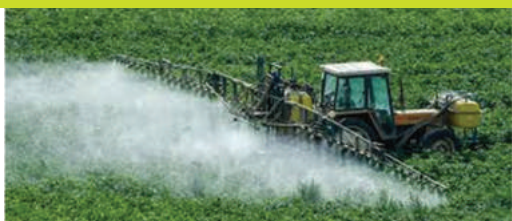
➤ 食品: 农残及毒素