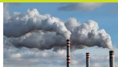
➤ 气体: PCB、PAH、VOC、BTEX等